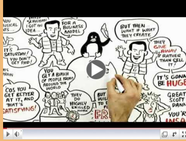
Dan Pink and RSA Animate Enlighten!