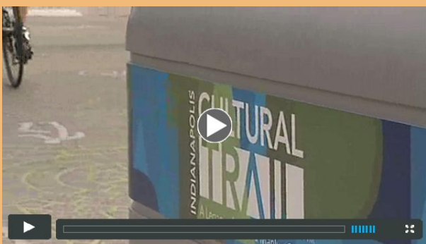
Indianapolis Cultural Trail