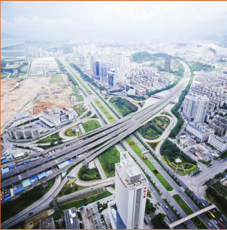
....The Infrastructure Puzzle

Bold thinking and a desire to create a better city have given us two best effort examples on funding the gap between what we have and what we want. A Republican mayor and a Democratic mayor are pursuing innovative new infrastructure plans for their cities that prioritize wealth-creating and tax-base-expanding projects and bring new investment opportunities to the table.