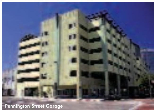
Pennington Street Garage

Leighton also wisely decided to use ground-up concrete from the building razed to make room for the garage in the foundation. In the lobby the concrete is polished to a high sheen. ▶