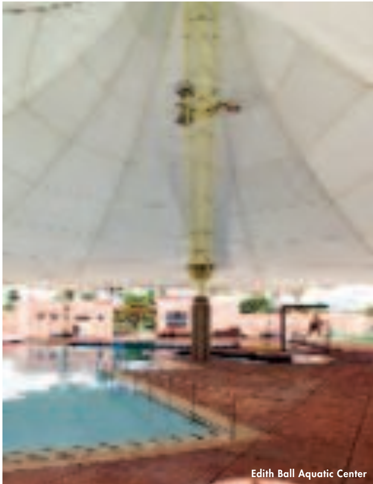
Edith Ball Aquatic Center

Located in Reid Park near 22nd Street and Alvernon Way Burns Wald-Hopkins Architects